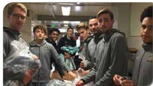
Arapahoe Boys Basketball Team volunteers at TLC.