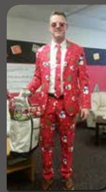
A volunteer driver delivering meals during the holidays.