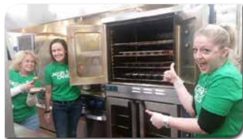
Volunteers from Faegre Baker Daniels LLC baking for our seniors.

National Charity League – Made Trail Mix & Valentines