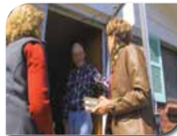
Upper right: Mayor Cathy Noon